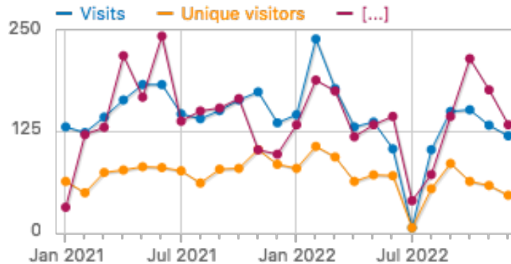
Fig. 2: VESPA portal use in 2021-22 (average visit duration in violet, max value is 10 min) – monitoring was down in July 2022.

and IVOA meetings. The VESPA Confluence wiki ( https://voparis-wiki.obspm.fr , mostly for data providers and beneficiaries) has 170 connections / month.